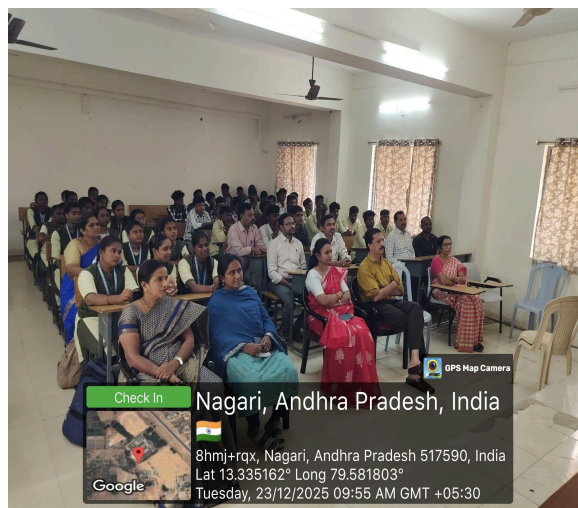
Principal, Staff and students attending the conference