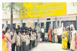
వీర్ బాల్ చరిత్రకత గురించి విద్యార్థులకు ప్రసంగం చేస్తున్న ప్రిన్సిపాల్