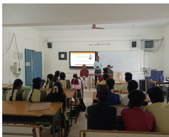
Students attending the programme